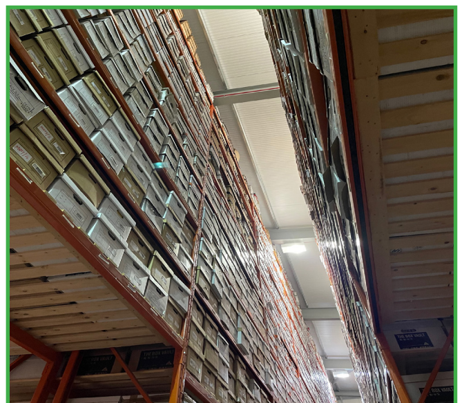
Boxes of files at an archive